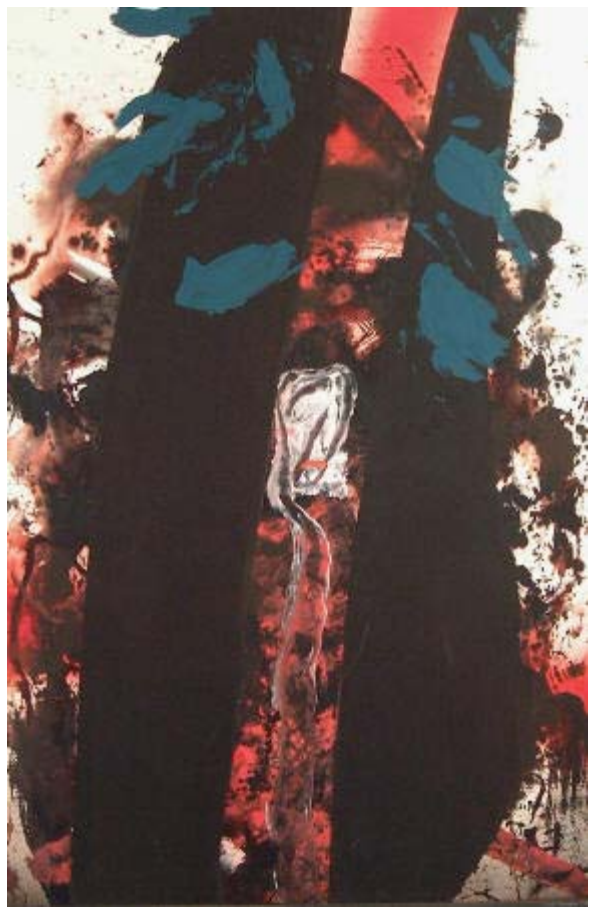
May 3, 1982