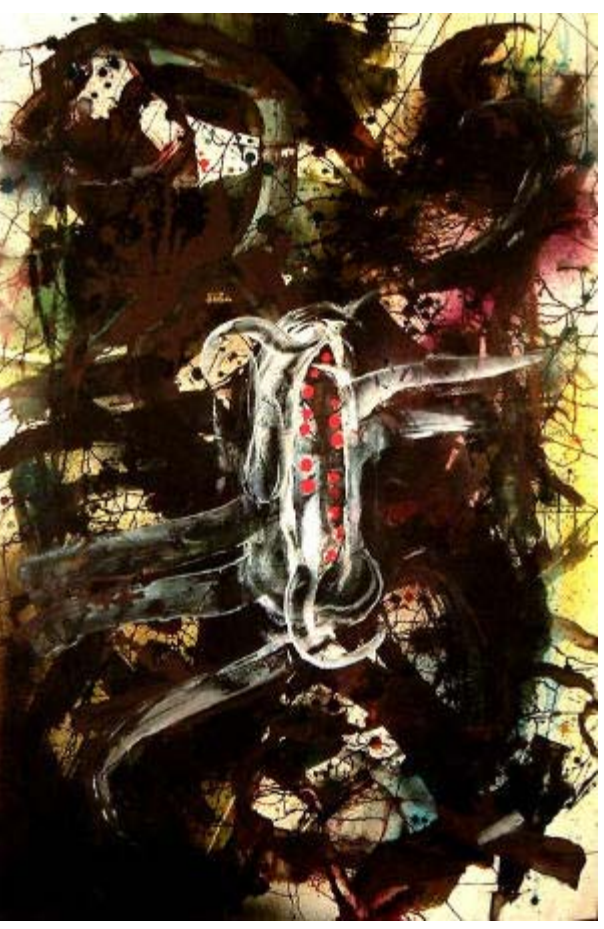
January 13, 1982