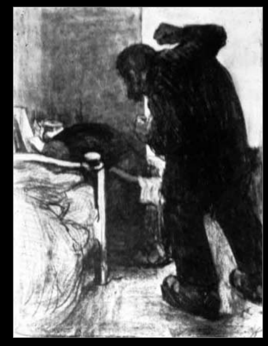
Drunken Man, 1908-9

"...for the most part I ignore when people assert that my one subject is always the lot of the unfortunate. Sorrow isn't confined to social misery. All my work hides within it life itself, and it is with life that I contend through my work."