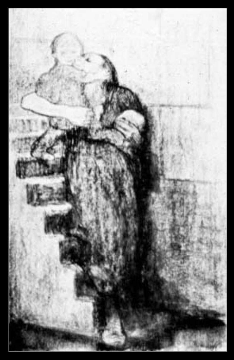
Suicide by Drowning, 1909