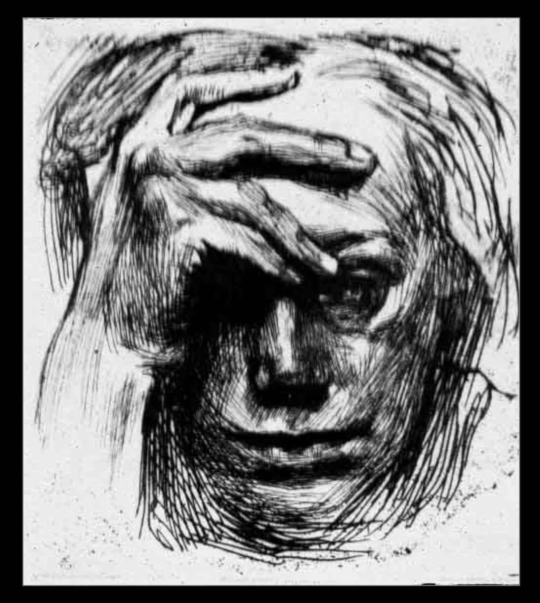
Self Portrait, 1910