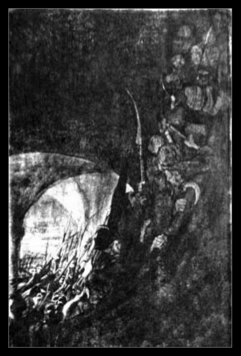
Peasants' War IV, Seizing Arms. 1906