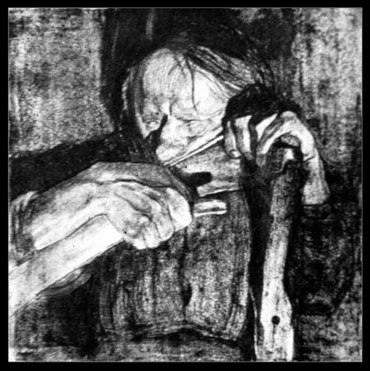
Peasants' War III, Whetting the Scythe. 1905