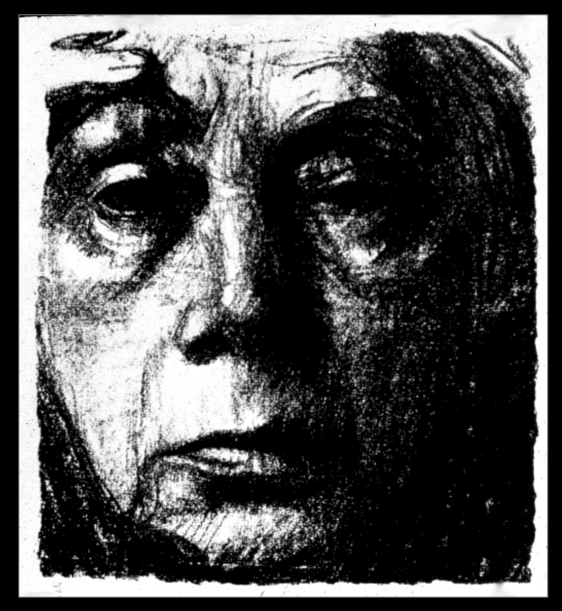
Self Portrait, 1934