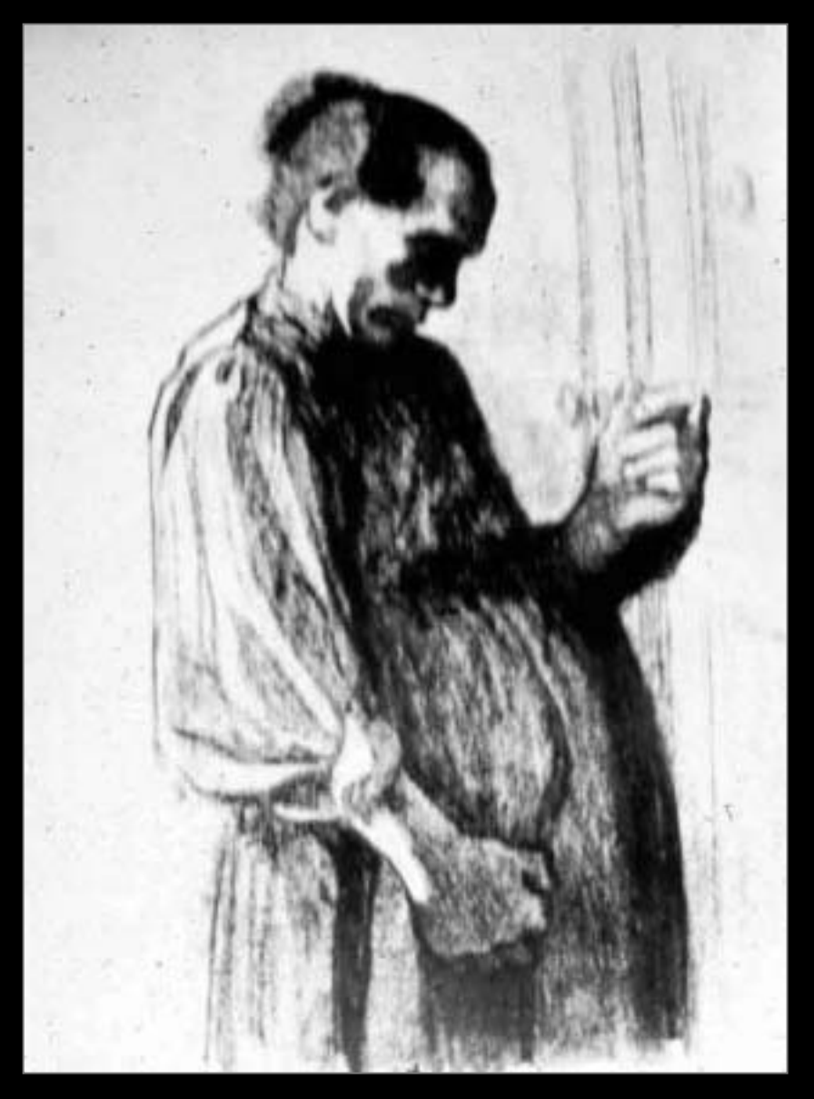
At the Doctor's, 1908-9