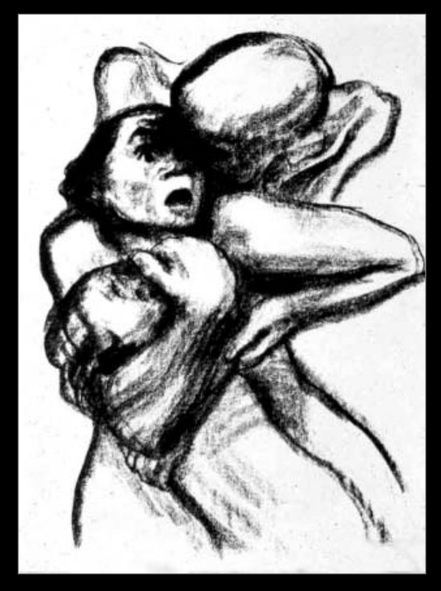
Death IV, Death Seizes a Woman