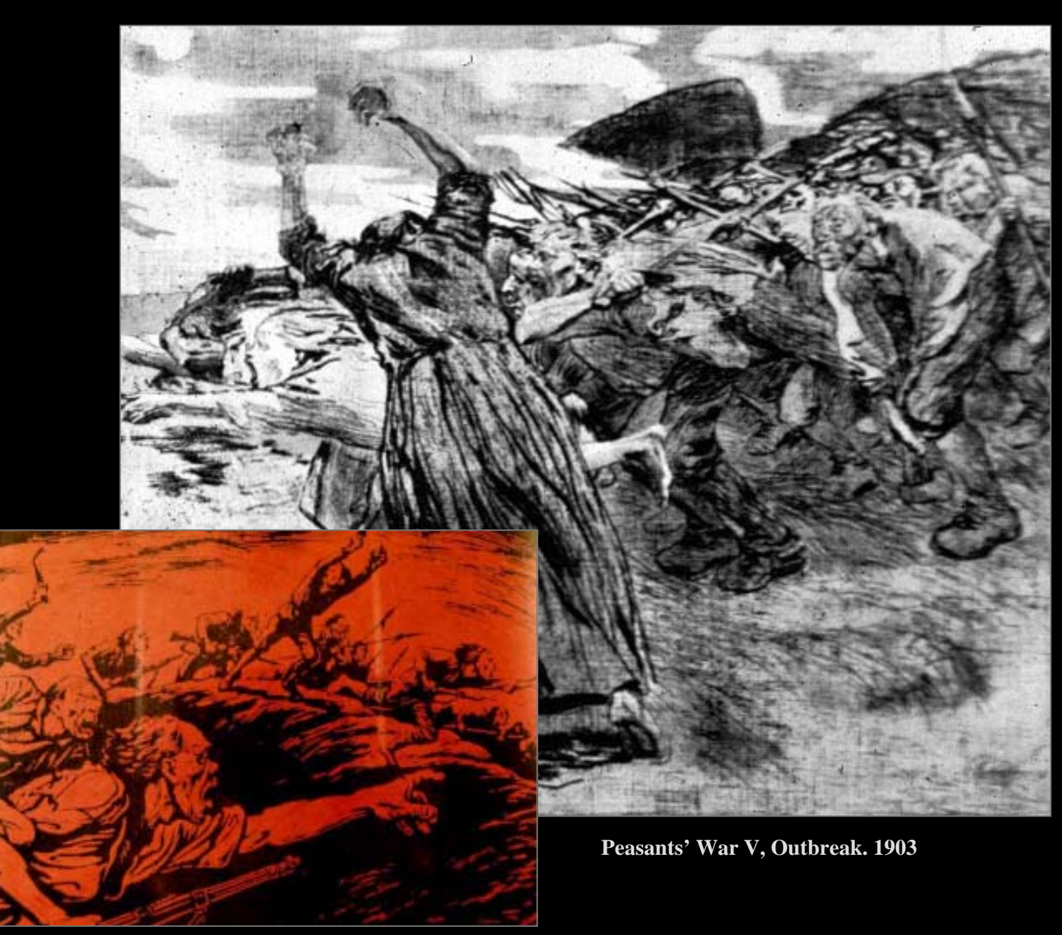
Chinese Communist Poster, ca 1930's