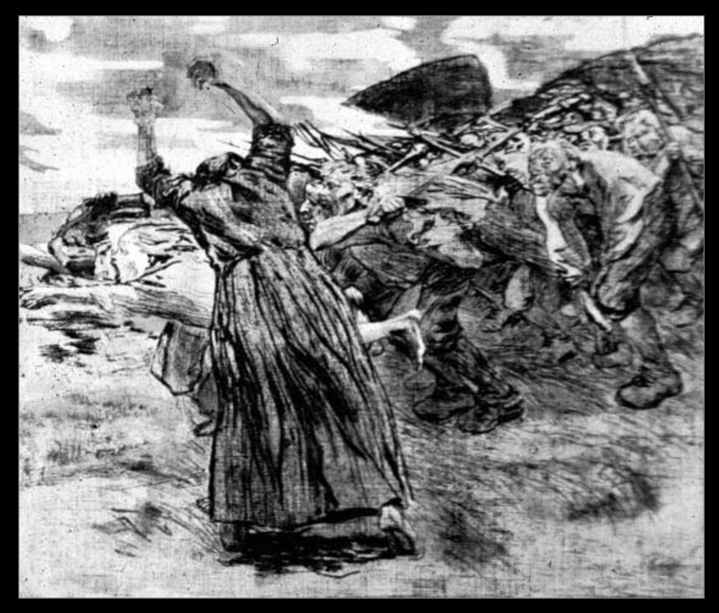
Peasants' War V, Outbreak. 1903