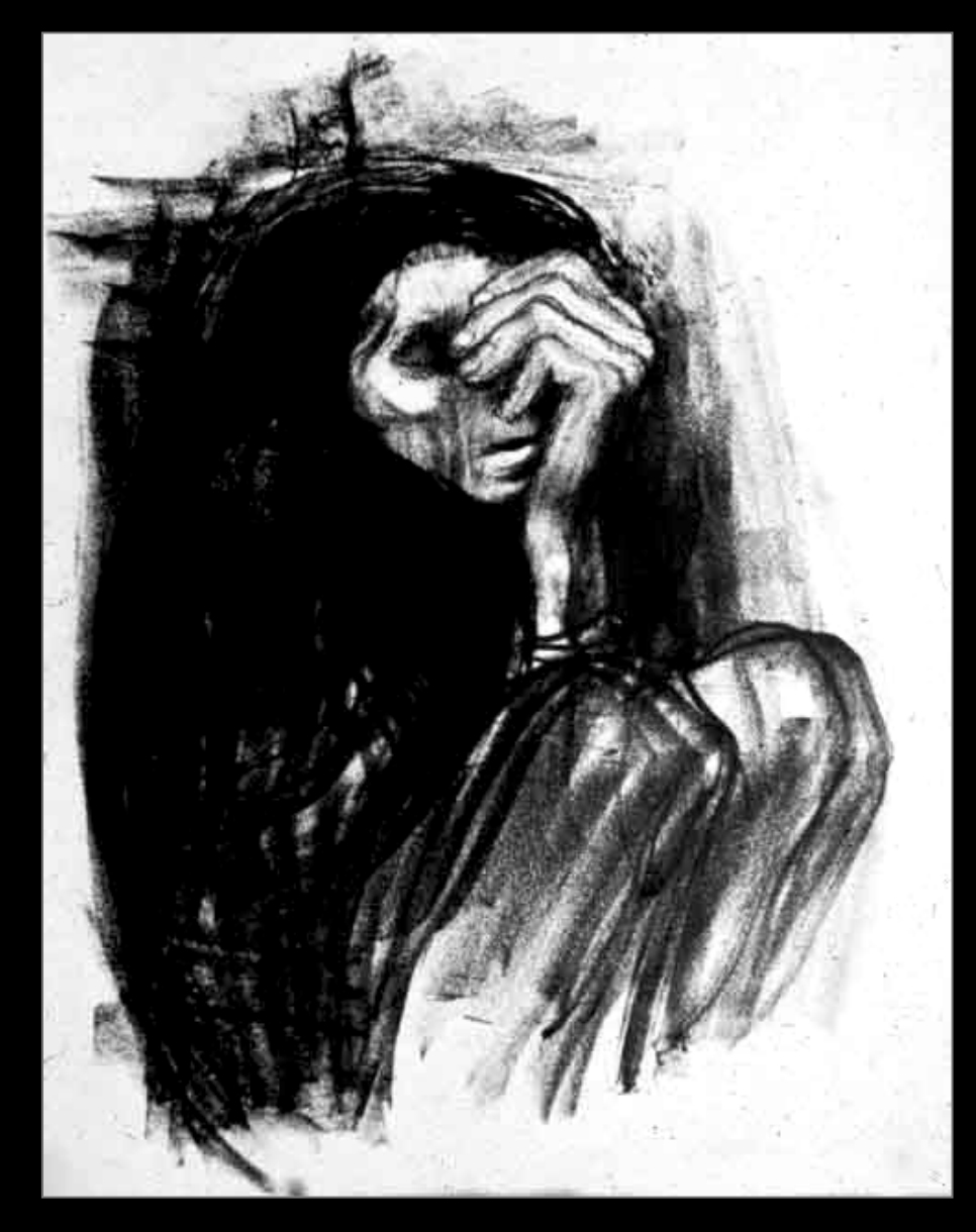
Death V, Death on a Roadside