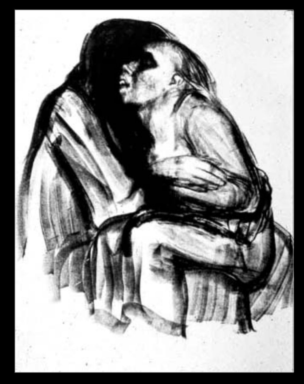
Death II, Death Holding a Girl in His Lap