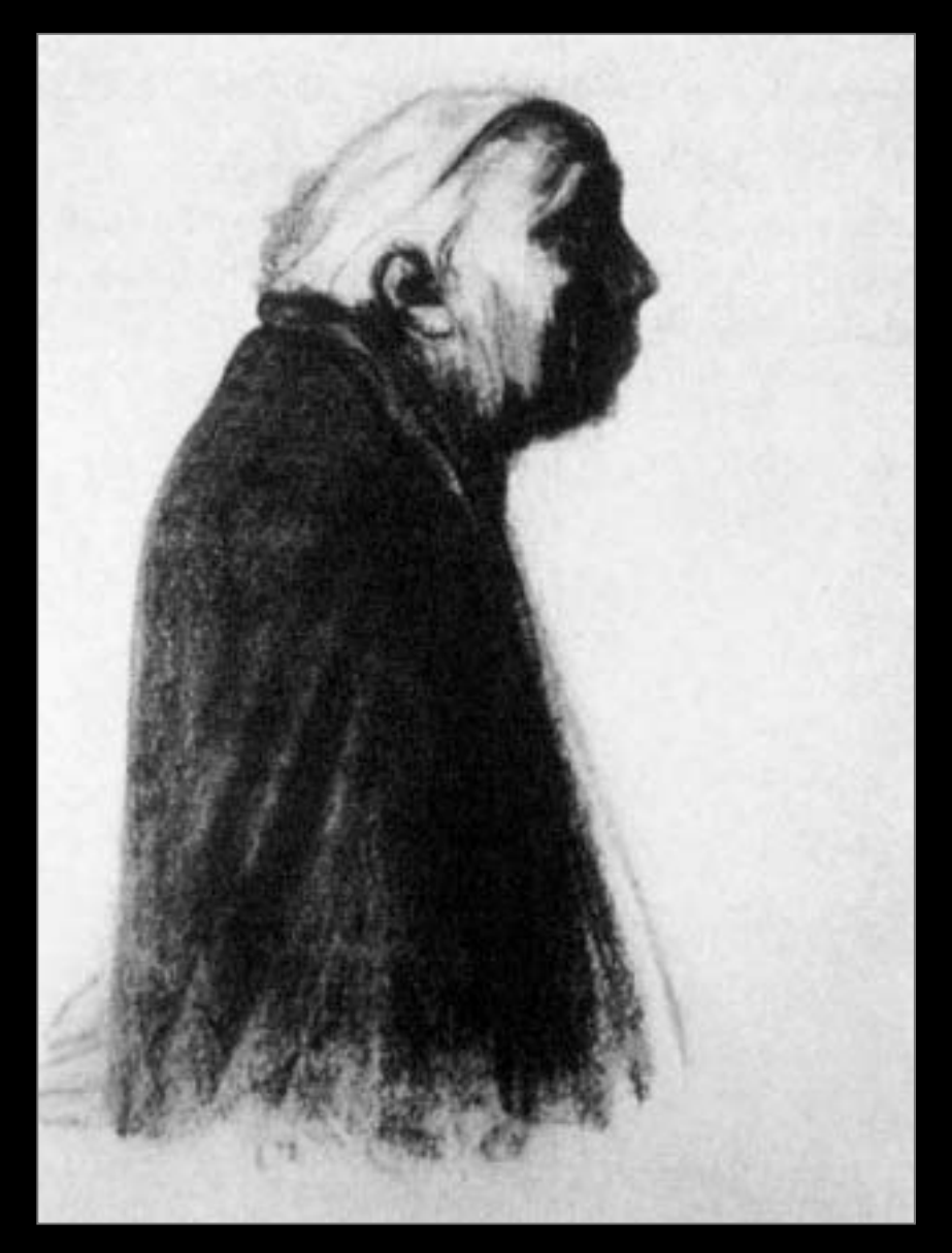
Self Portrait, 1938