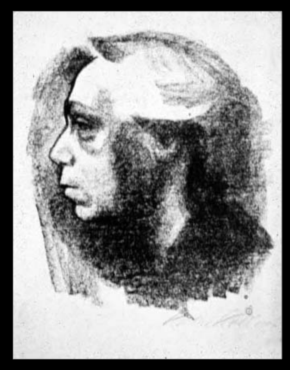
Self Portrait, 1919