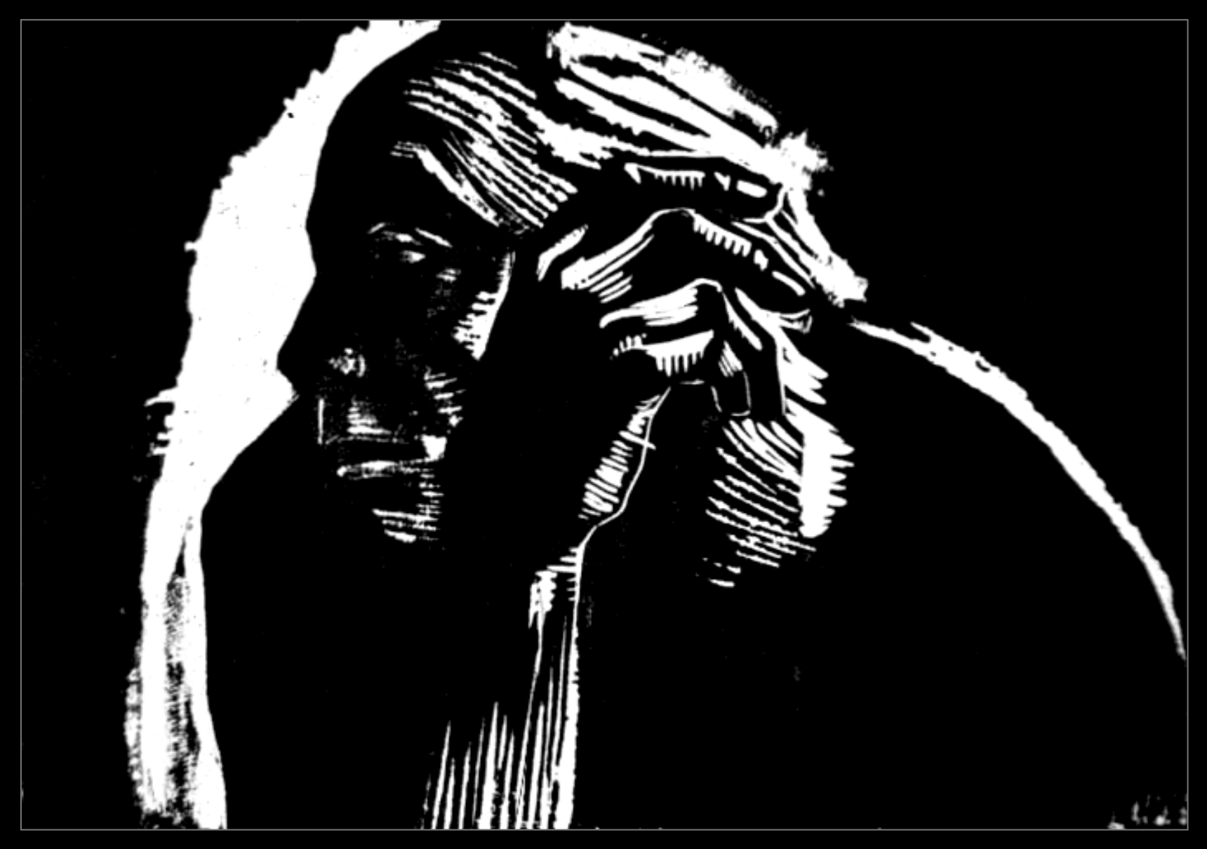
Self Portrait, 1924