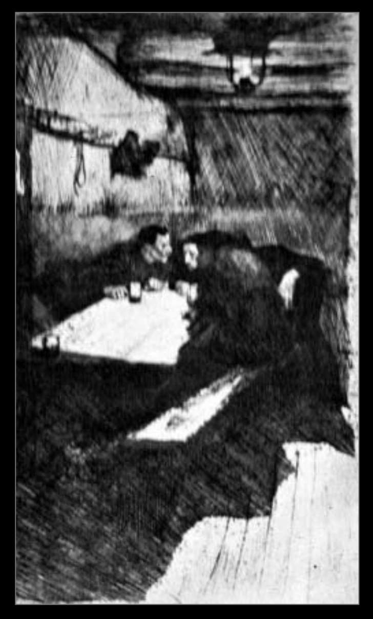
The Weavers III, Conspiracy