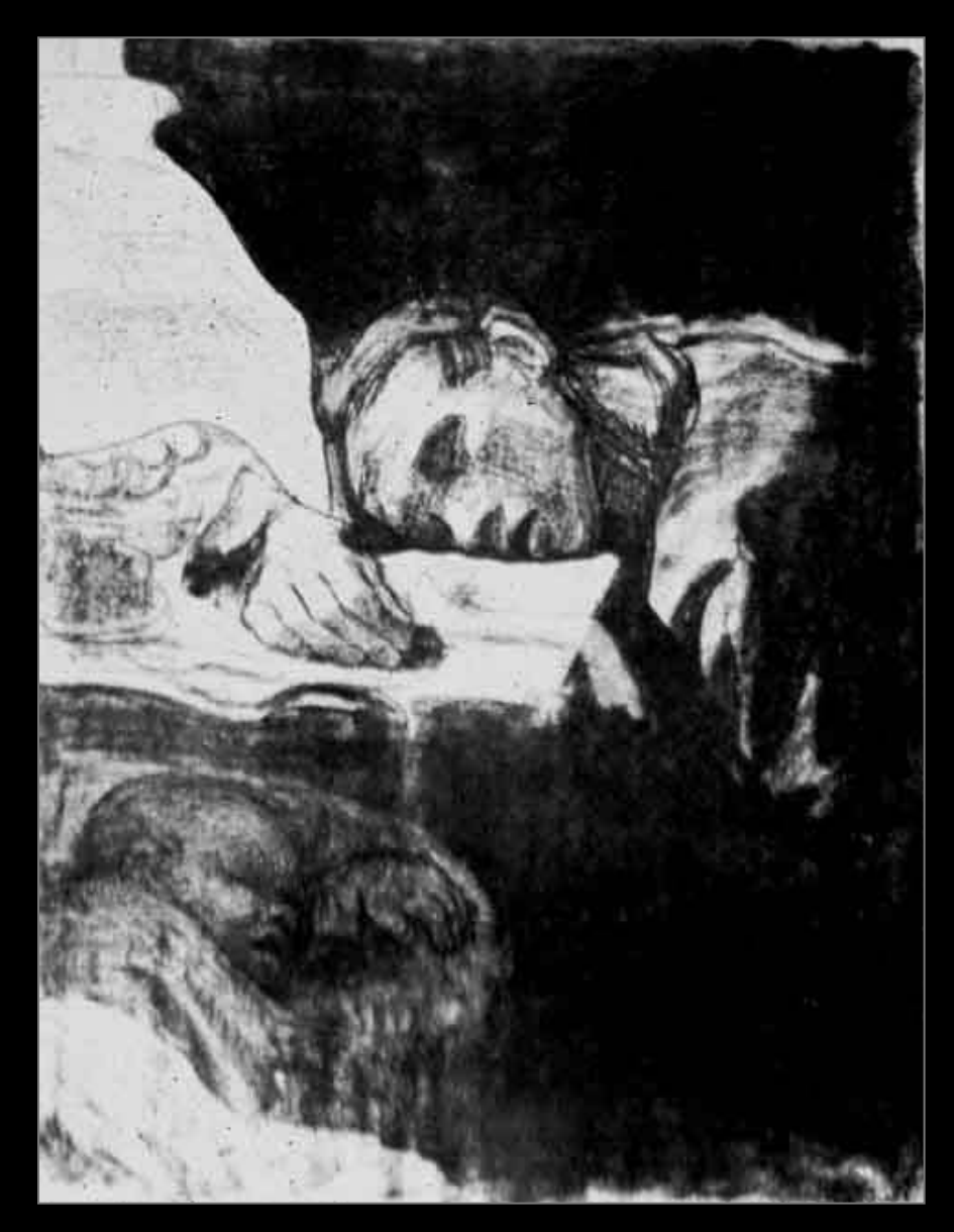
Home Industry, 1909

"With fingers weary and worn, With eyelids heavy and red, A woman sat in unwomanly rags, Plying her needle and thread---Stitch! Stitch! Stitch! In poverty, hunger, and dirt And still with the voice of dolorous pitch She sang the song of the shirt. Work—work-work— Till the brain begins to swim, Work—work—work Till eyes are heavy and dim! Seam, and gusset, and band, And band, and gusset, and seam, Till over the buttons I fall asleep And sew them on in a dream!"