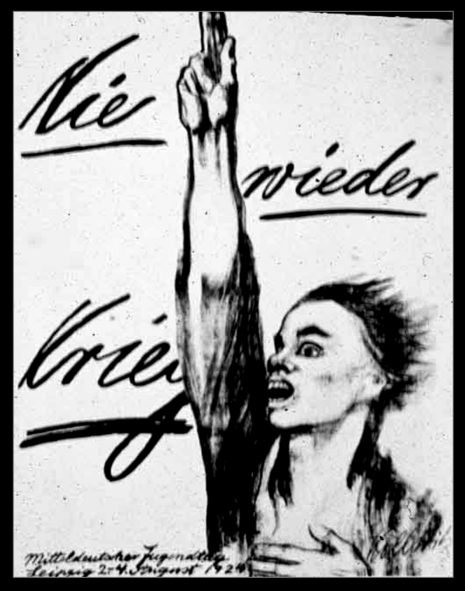
No more War, 1924