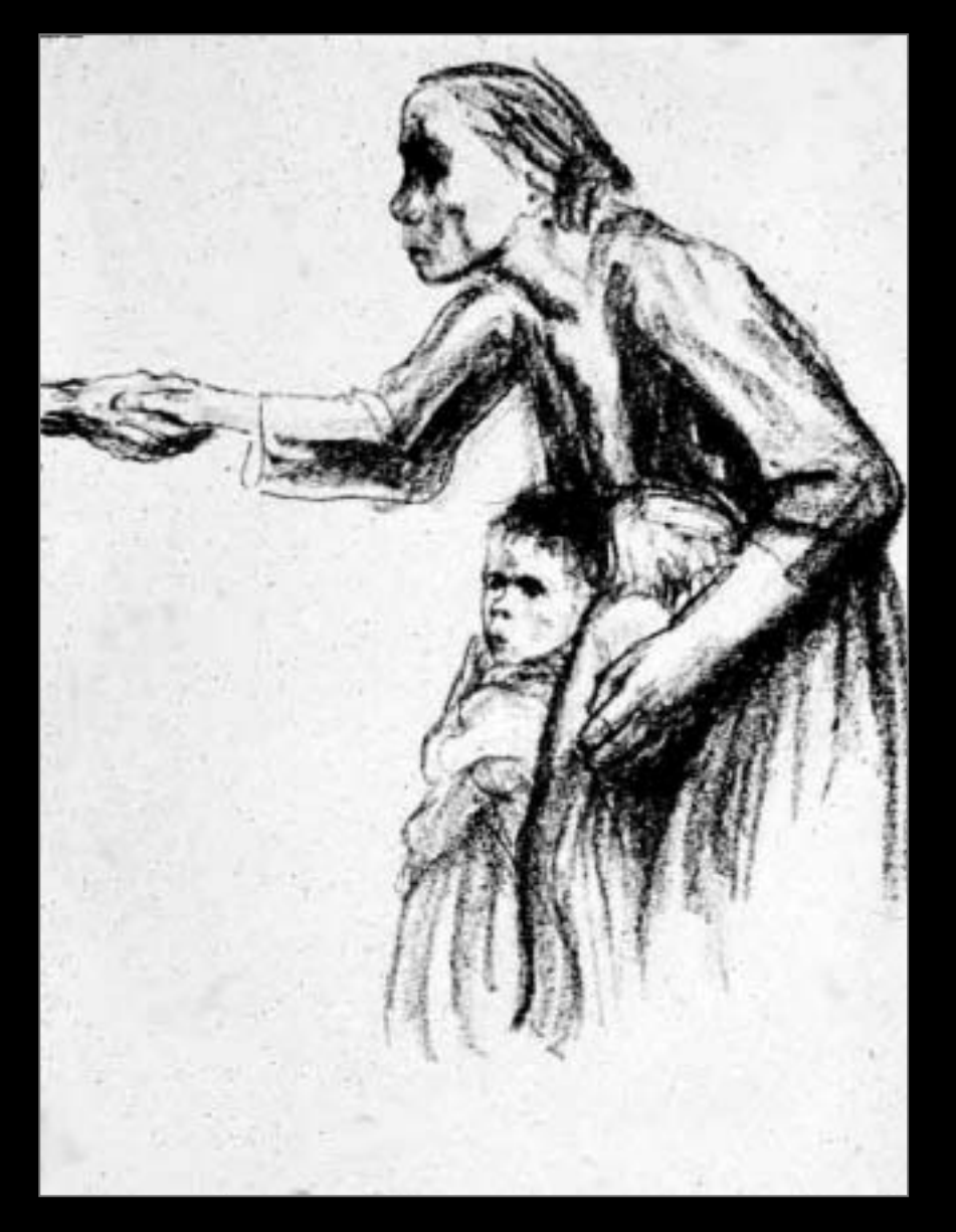
Death I, Woman Giving Herself Up to Death