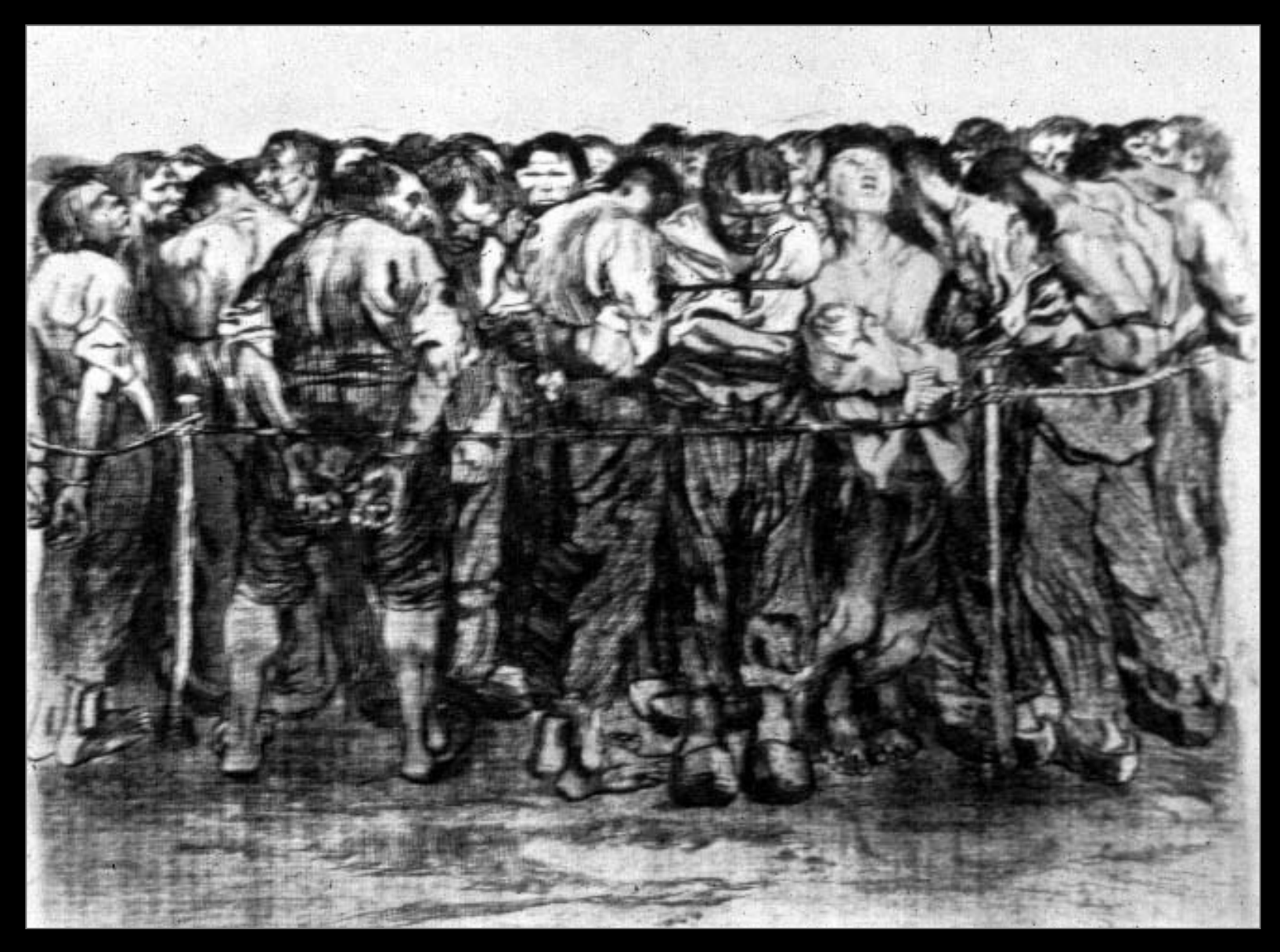
Peasants' War VII, Prisoners. 1908