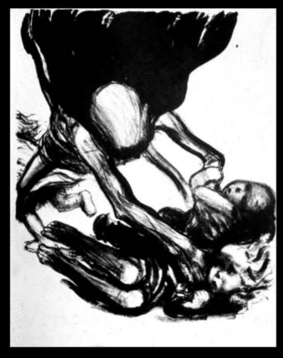
Death III, Death Swoops Down on Children