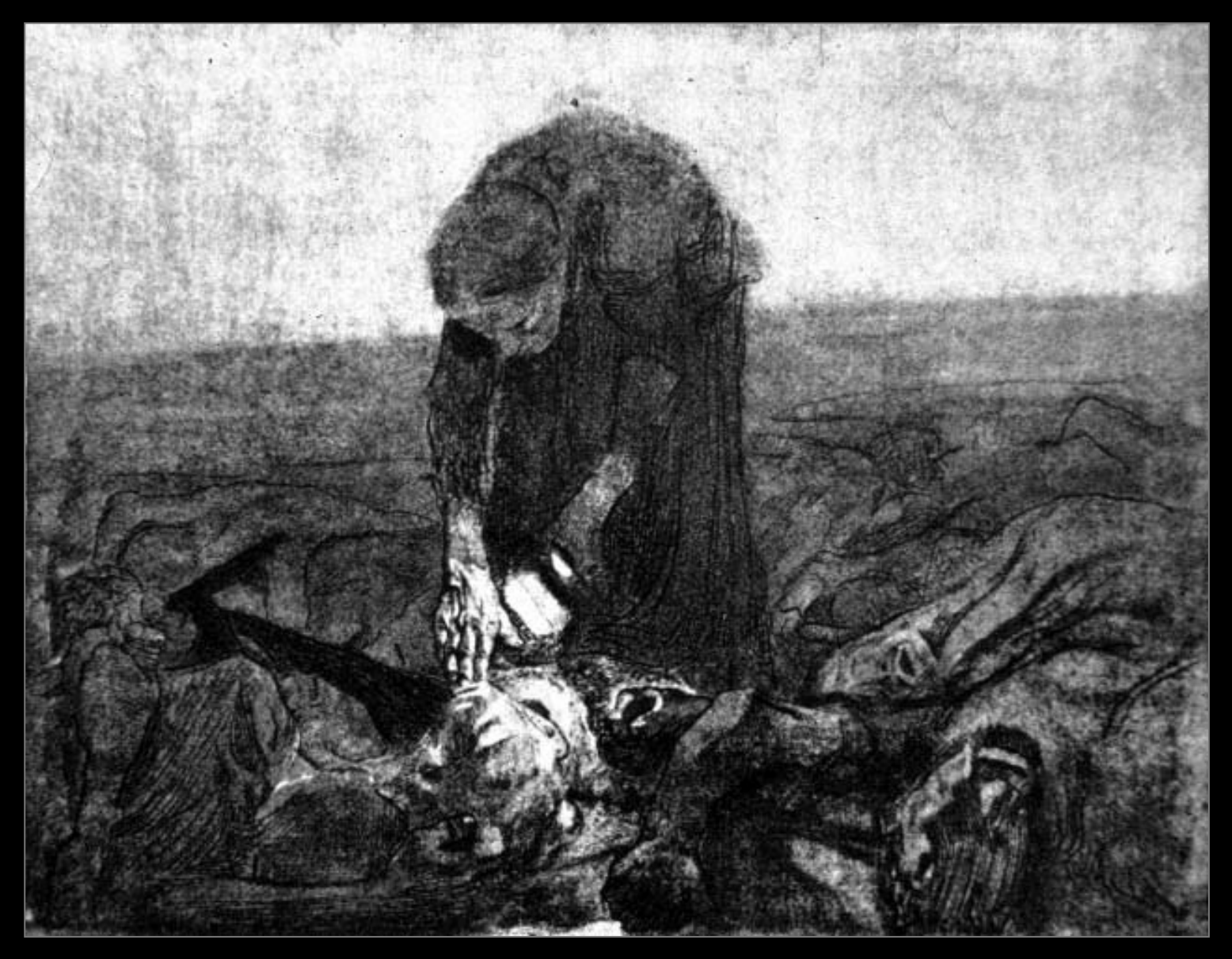
Peasants' War VI, After the Battle. 1907