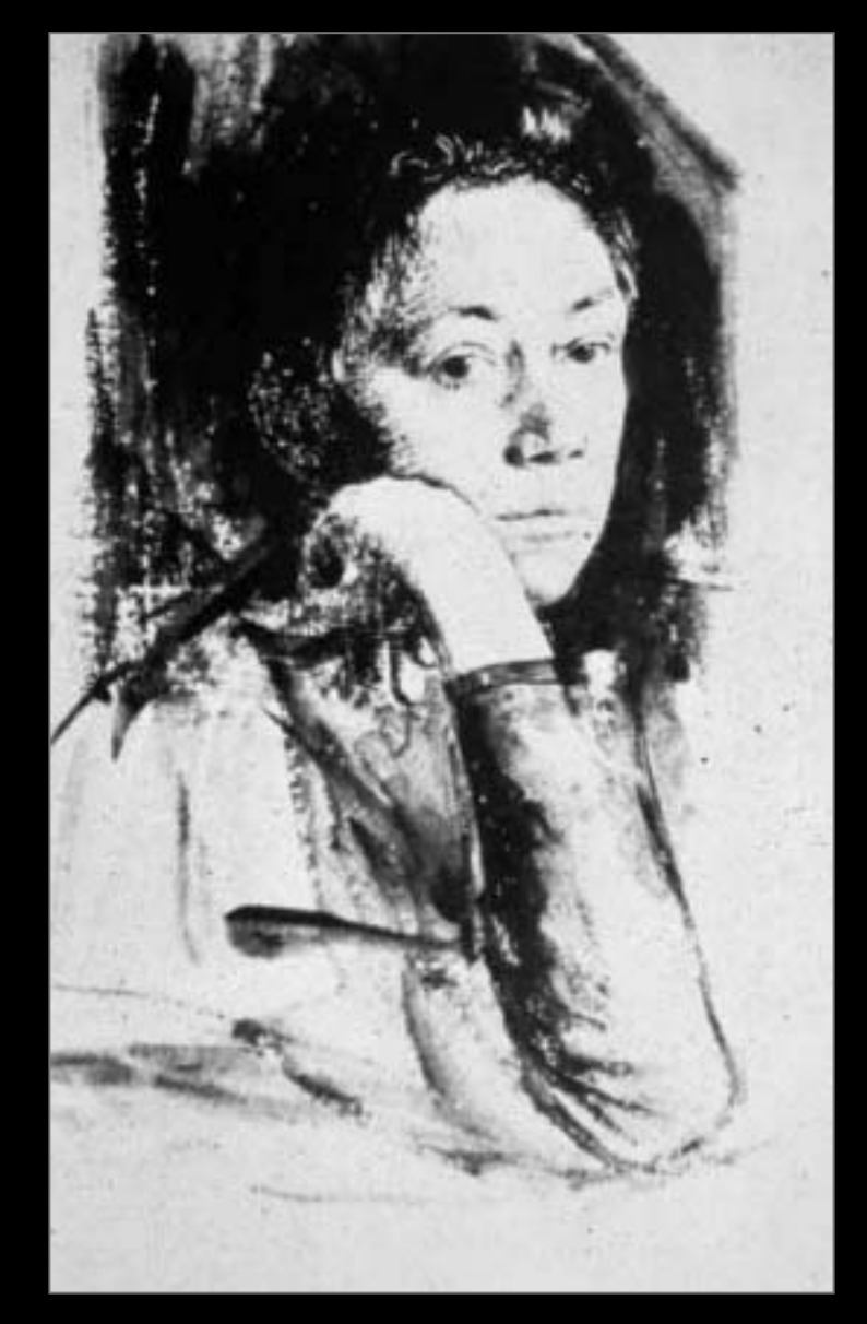
Self Portrait, 1891-2

"Shortly before our marriage in 1981, my father said to me, 'You have made your choice now. You will scarcely be able to do both things. So be wholly white you have chosen to be.' "