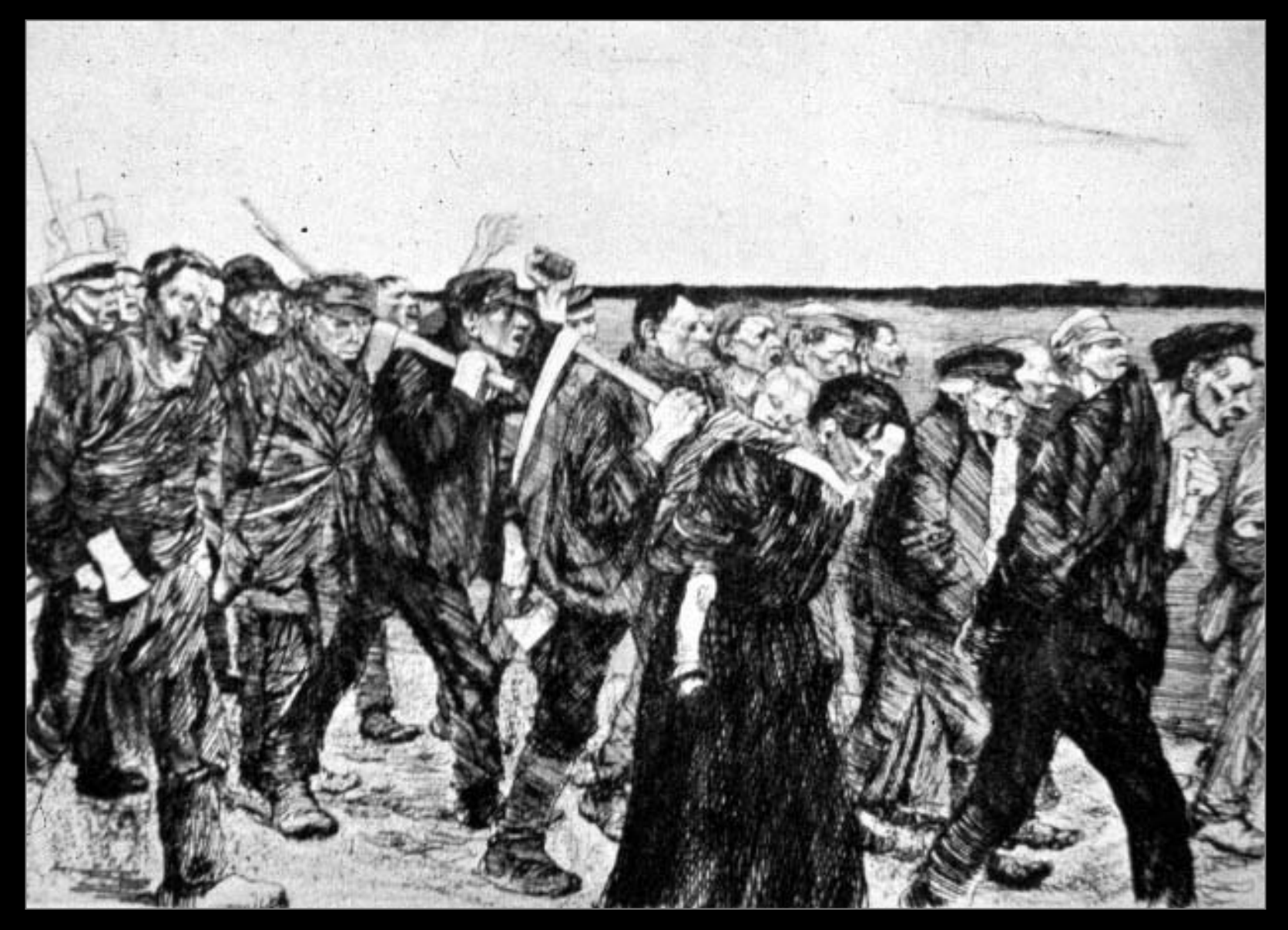
The Weavers IV, The March