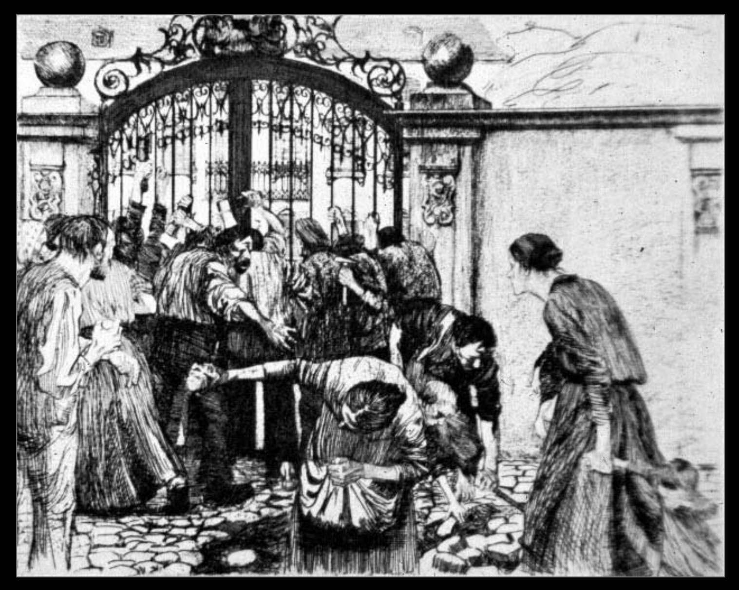
The Weavers V, The Attack