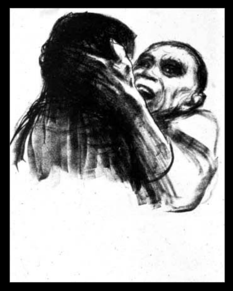
Death VI, Death Recognized as a Friend